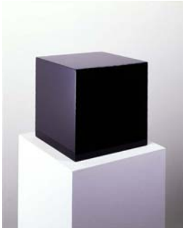
JOHN MCCRACKEN Black Block , 1971 Polyester resin, fiberglass, and plywood 12 x 12 x 12 in. 30.5 x 30.5 x 30.5 cm Initialed and dated on base McCrj001