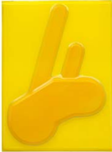
CRAIG KAUFFMAN Untitled , 1965 Vacuum formed acrylic 47 1/8 x 45 in. 119.7 x 114.3 cm