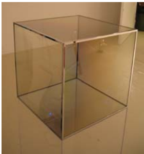
LARRY BELL Untitled , 1969 vacuum-plated glass with metal binding 18 1/4 x 18 1/4 x 18 1/4 in. 46.4 x 46.4 x 46.4 cm