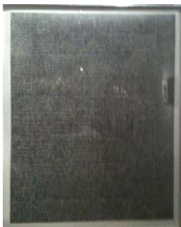
ED MOSES (1926 - ) Untitled , 1966 Graphite on paper 21 3/4 x 17 3/4 in. 55.2 x 45.1 cm