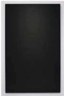
ROBERT IRWIN (1928-) Black Painting with Blue Edge , 2008 -2009 honeycombed aluminum panel with lacquer and polyurethane paint 77 1/2 x 48 in. 196.9 x 121.9 cm