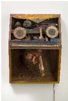
ED KIENHOLZ (1927 - 1994) Untitled (with piano keys) , 1960 Mixed media 28 1/4 x 20 1/4 x 15 1/8 in. 71.8 x 51.4 x 38.4 cm