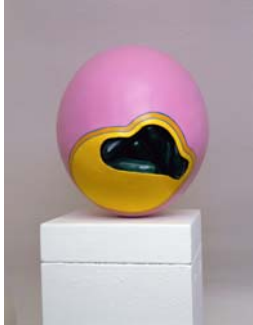
KEN PRICE (1935 - ) Pink Egg , 1964 fired clay with glaze and acrylic paint 5 1/2 x 4 1/2 x 5 in. 14 x 11.4 x 12.7 cm