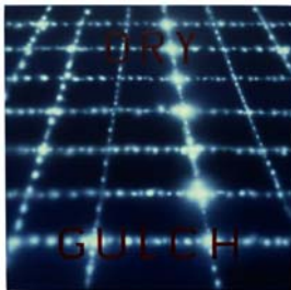
ED RUSCHA Dry Gulch , 1986 Oil and acrylic on canvas 30 x 30 in. 76.2 x 76.2 cm