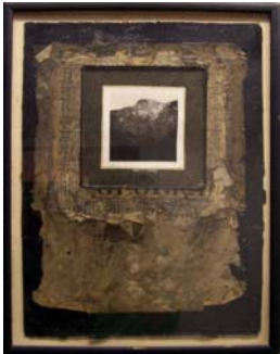
LLYN FOULKES (1934 - ) Geographical Survey of Eagle Rock, 1962 collage 10.25 x 10.75 in. 26 x 27.3 cm