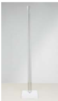
ROBERT IRWIN (1928-) Column , 1967 acrylic 114 x 4 x 5 in. 289.6 x 10.2 x 12.7 cm