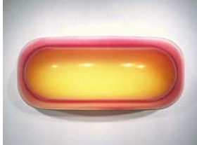
CRAIG KAUFFMAN (1932 -) Untitled , 1968 acrylic and vacuum formed plexiglas 22 x 52 x 15 in. 55.9 x 132.1 x 38.1 cm