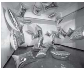
ANDY WARHOL (1928-1987) silver clouds AW6