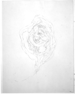
BRUCE CONNER (1933-2008) Yin Yang, April 29, 1962 Calle Napoles 77-4, Mexico City, Mexico, 1962 Pencil on paper 25 x 18 7/8 in. 63.5 x 47.9 cm