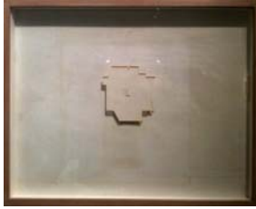
ED MOSES (1926 - ) Untitled , 1967 Graphite on museum board 13 7/8 x 17 1/4 in. 35.2 x 43.8 cm