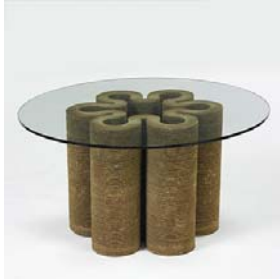
FRANK GEHRY Occasional Table , 1971 made by Easy Edges, Inc USA corrugated cardboard, masonite, glass 41 diameter x 22.75 in. 104.1 diameter x 57.8 cm