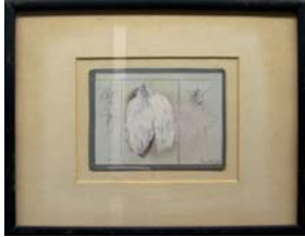
LLYN FOULKES (1934 - ) painting , 1962 cabinet card with paint and frame 10.25 x 13.25 in. 26 x 33.7 cm