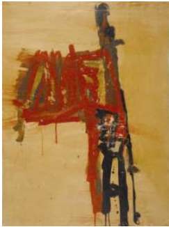
JAY DEFEO (1929 - 1989) Untitled, 1952 tempera on paper 31.5 x 23.375 in. 80 x 59.4 cm