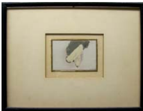
LLYN FOULKES (1934 - ) Agon, 1960 carte de visite with paint and frame 10.25 x 13.25 in. 26 x 33.7 cm